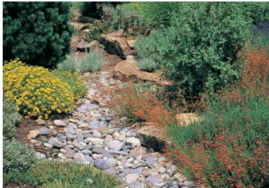
JUST BECAUSE XERISCAPES SAVE WATER DOESN'T MEAN THEY HAVE TO BE DRY AND BORING. THE XERIC LANDSCAPE ABOVE RECREATES THE FEEL OF A MOUNTAIN STREAMBED.

Xeriscaping with water-wise plants makes sense in New Mexico. This brochure gives you step-by-step information that will help you convert your old, water-thirsty landscape into an attractive water-wise xeriscape.