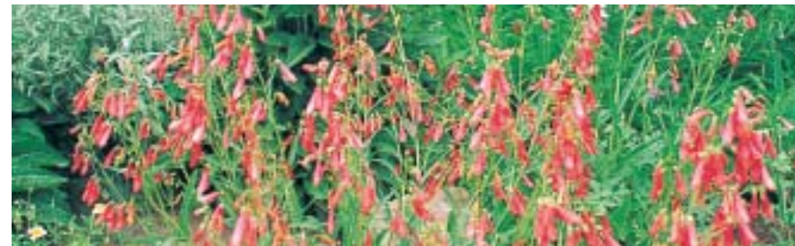
ADD BRIGHTLY COLORED NATIVE FLOWERS SUCH AS PENSTEMON TO YOUR XERISCAPE.

Plan on paying a professional $0.60 or more per square foot to convert an existing irrigation system. A do-it-yourself irrigation conversion will typically cost approximately $0.20 per square foot. (It's advisable to consult a professional to determine if your existing irrigation system can be used.)