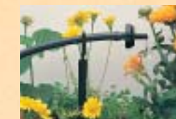
DRIP EMITTERS DELIVER A SPECIFIED AMOUNT OF WATER PER HOUR—TYPICALLY FROM A HALF GALLON TO AS MUCH AS FOUR GALLONS.