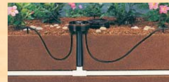
A MULTI-EMITTER HYDRANT CAN REPLACE AN OLD SPRINKLER HEAD.