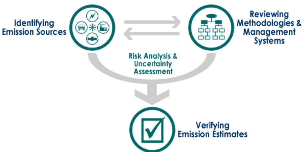
Figure 3.1. The Verification Process