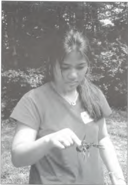
Examining a crayfish in the Learn About Water program at Cronin Salmon Station.