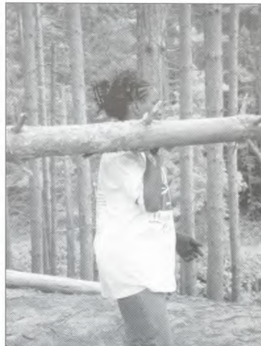
Learn About Water participant engaged in erosion control stewardship project at Swift River, Quabbin Reservoir.