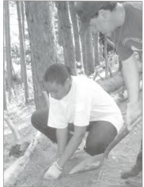
Learn About Water participant plants tree to control erosion at Swift River, Quabbin Reservoir.