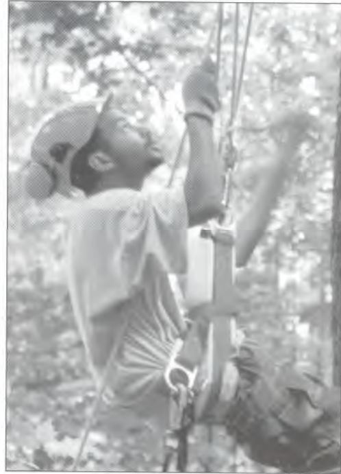
Climbing a tree as part of the Learn More About Forests program, Peru, MA.