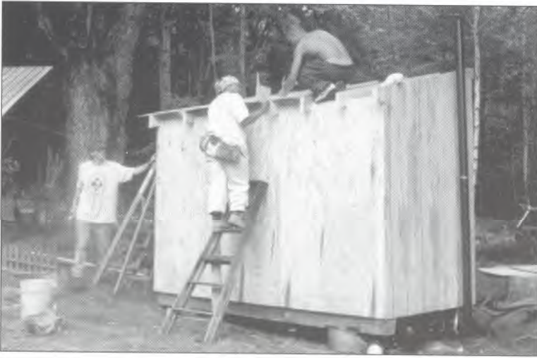
YouthBuild students perform community service with EEI. Here they are putting the roof on the new bathhouse in Peru, MA.