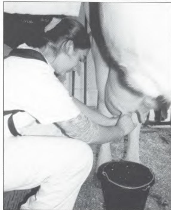
Youth milking a cow for the first time in the Learn About Agriculture program at Great Brook Farm.