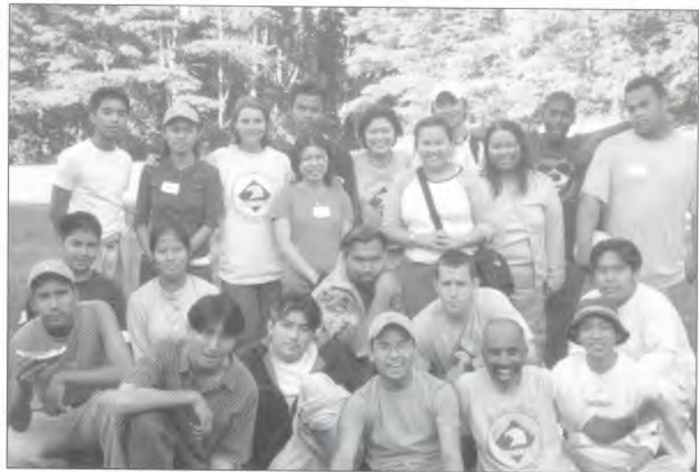
The River Ambassadors youth group of Lowell participates in the Learn About Water program at the Quabbin Reservoir.

"This taught me to not waste water and remember where it comes from and all the hard work it took."