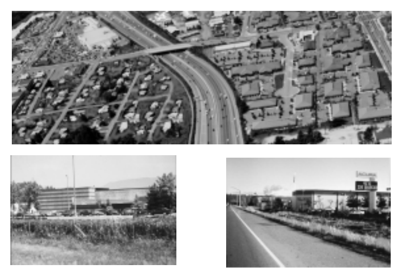
Community 1 - Little planning for landscape or green space has occurred

Social scientists often study the relationship of people to place. The form and character of a place can shape the moods, attitudes and responses of the people who spend time in them. More recently communities have begun to consider the effect of character of place on both residents and visitors. Business communities, in particular, take an interest in the image that their community projects to consumers.