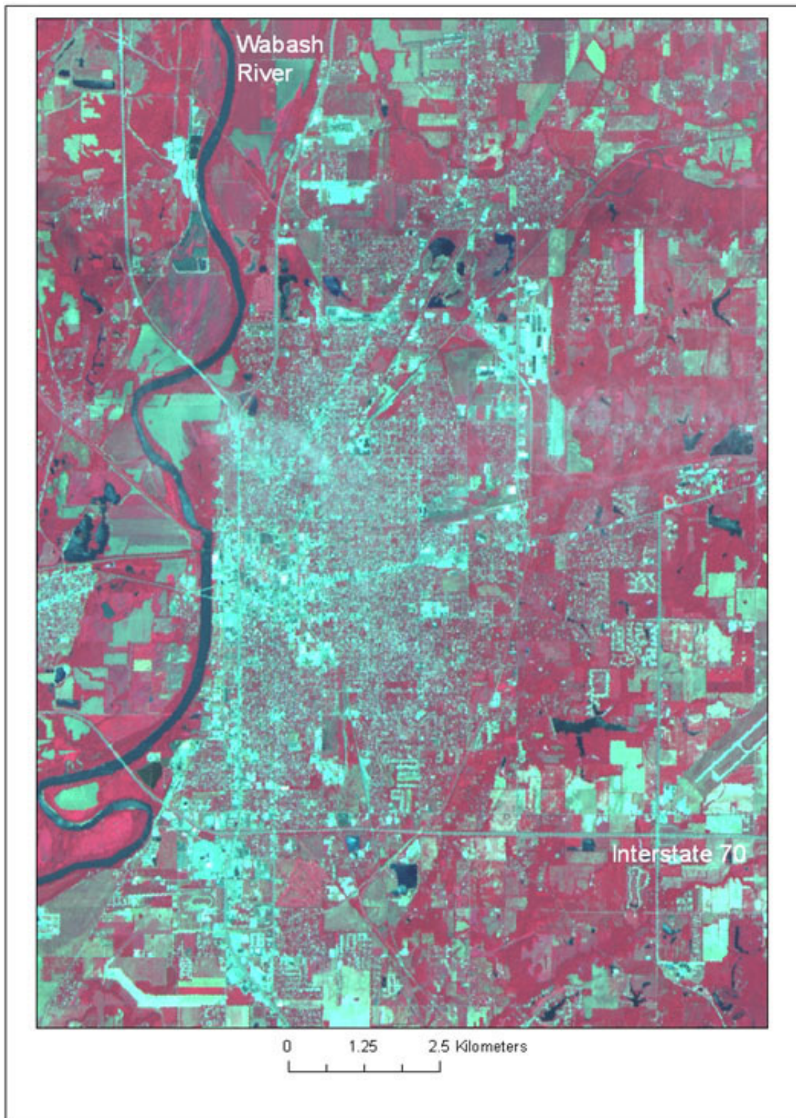
Fig. 2. False color composite (ASTER bands NIR, Red, Green → RGB) of the study area, with the Wabash River and Interstate 70 labeled.