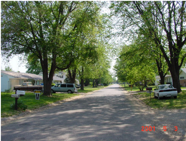
Fig. 1. A tree-lined street in Terre Haute.

The city of Terre Haute is located in Vigo County along the banks of the Wabash River in west-central Indiana, USA (Figs. 1 and 2). Terre Haute has made a conscious effort to maintain the urban tree canopy through a comprehensive tree ordinance that governs tree removal and tree planting. The ordinance is administered by a rotating tree board, which may also grant exceptions to the code. Terre Haute had a population of 69,614 in 2000, with an observed county-wide median income of $33 184 and median housing value of $72 500 (United States Census Bureau 2000).