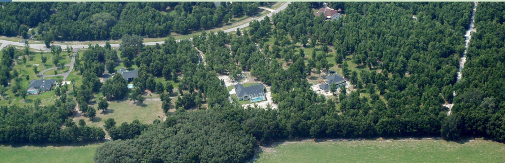
Figure 1. The isolated interface is made up of structures interspersed in remote areas.