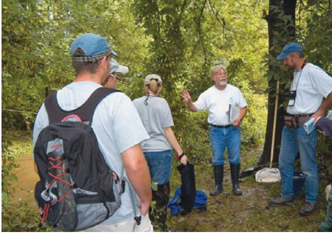
Residents, landowners, and policy makers need science-based information to make good decisions and follow appropriate practices.