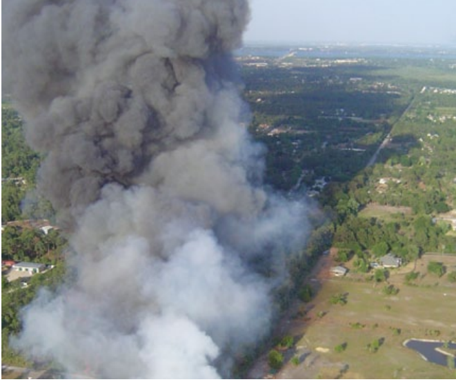
Smoke concerns are a major issue in the wildland-urban interface.

Some specific management challenges relate to fire, recreation, and wildlife. The influx of newcomers into the interface makes it harder to use prescribed burns and other fuel reduction treatments. People may oppose the use of prescribed burning because the resultant smoke causes health and traffic concerns. The risk of wildfire damage to human life and property increases with more development in forested areas. Because wildland and structural fires behave very differently, suppression of interface fires is more difficult. Crews must be trained in both wildland and structural firefighting techniques.