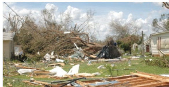
Tree and infrastructure damage following Hurricane Katrina.