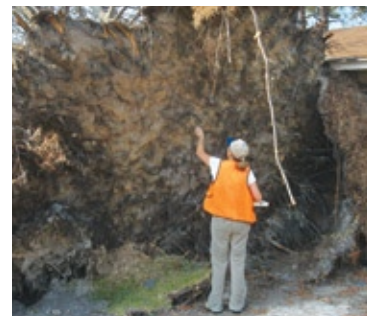
UF researcher evaluates the roots of a tree felled by Hurricane Katrina.

www.sfrc.ufl.edu/urbanforestry/research.html .