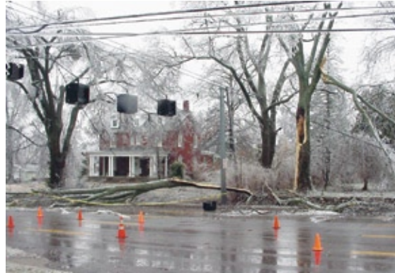
Ice storm damage to the urban forest.

The recently trained UFSTs got their first chance to apply what they had learned after a December ice storm hit east-central Oklahoma in December 2007. In early 2008, UFSTs worked for three weeks in the Tulsa and Oklahoma City area, providing communities with detailed tree risk assessments and debris estimates to aid with direct FEMA payment. UFST members provided invaluable assistance to the Tulsa Parks and Recreation Department during a time when they were overwhelmed with the task of clean-up (two months after the storm). In