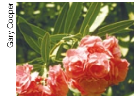
Oleander Nerium oleander