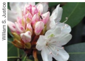
Rosebay Rhododendron maximum