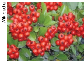
Scarlet firethorn Pyracantha coccinea