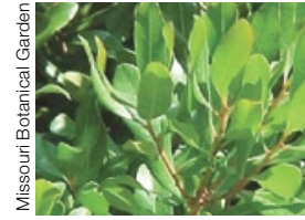
Bayberry Myrica pennsylvanica