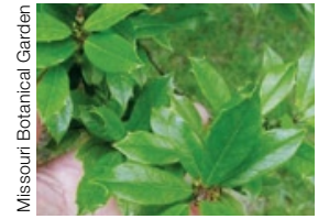
Foster holly Ilex x attenuata