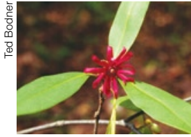
Anisetree Illicium floridanum