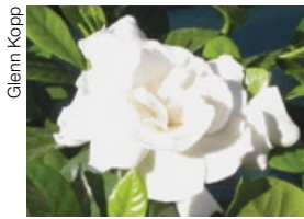
Gardenia Gardenia jasminoides