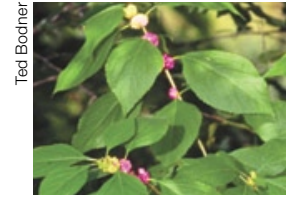
Beautyberry Callicarpa dichotoma