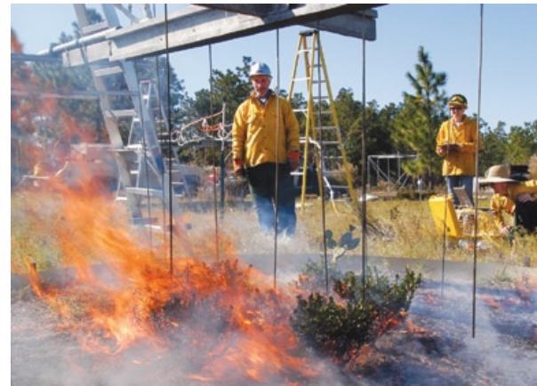
FS and UF researchers measure the flame temperatures and the rate of fire spread as shrubs and mulches burn.

To learn more visit: www.interfacesouth.org/products/research/flam_natural_veg_and_home_landscapes.html .