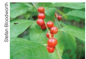
Winterberry Ilex verticillata