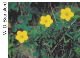
Shrubby cinquefoil Potentilla fruticosa