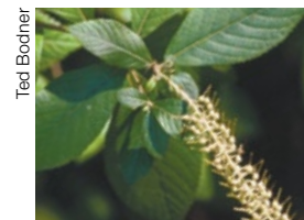
Sweet pepperbush Clethra alnifolia