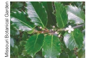
Missouri Botanical Garden