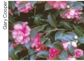
Camellia Camellia japonica