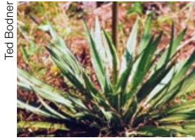
Adam's needle Yucca filamentosa

Shrubs suitable for planting within the defensible space; plant 6 feet or more from the house.