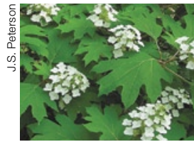
Oakleaf hydrangea Hydrangea quercifolia