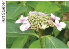
Bigleaf hydrangea Hydrangea macrophylla