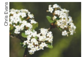
Walter's viburnum Viburnum obovatum