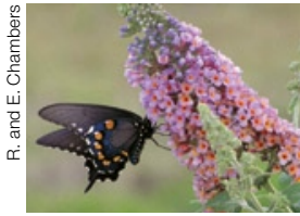
Butterfly bush Buddleia davidi