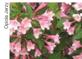
Weigela Weigela florida