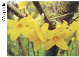
Klein's forsythia Forsythia x intermedia