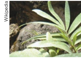
Coontie Zamia pumila