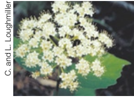
Arrowwood Viburnum dentatum