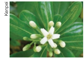
Pittosporum Pittosporum tobira