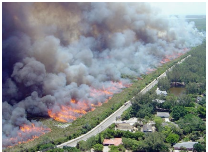
Figure 2. Images of communities in flames on the outskirts of cities are often used to depict the interface.

Determining the extent of total land area in the WUI in the South is difficult due to the variety of definitions and the rapid land-use change occurring in this region and across the country. A team of scientists with the U.S. Forest Service and the University of Wisconsin, Madison addressed this problem by mapping the