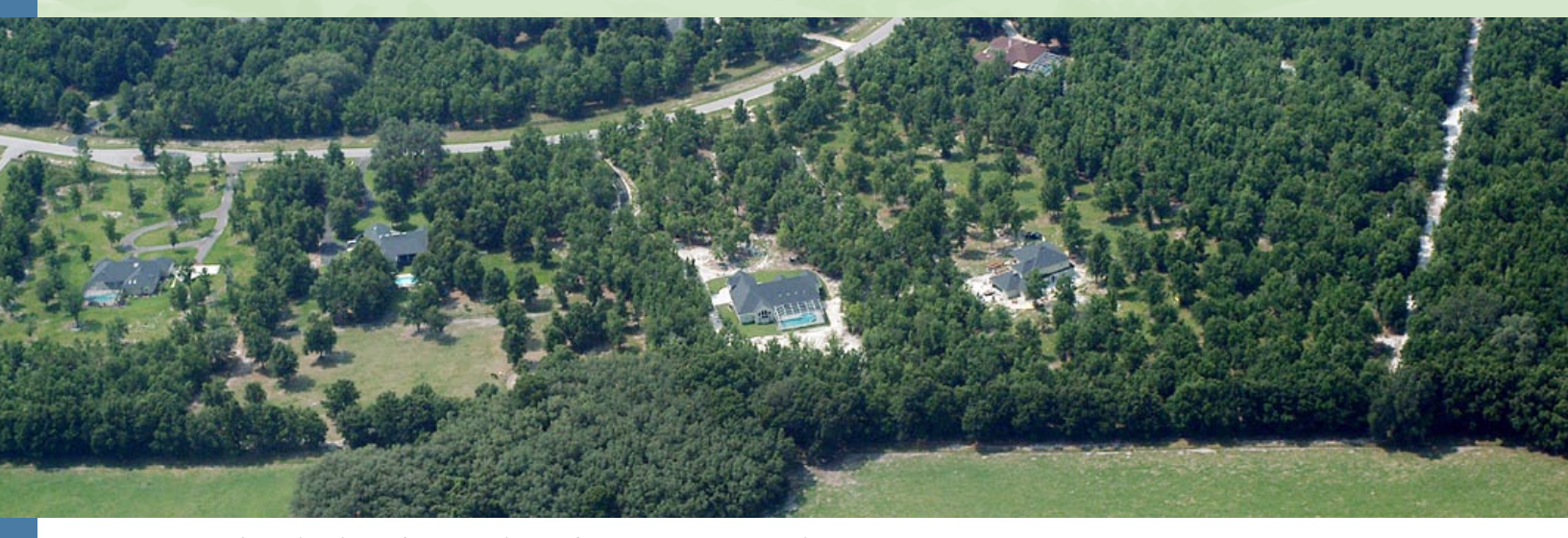
Figure 1. The isolated interface is made up of structures interspersed in remote areas.