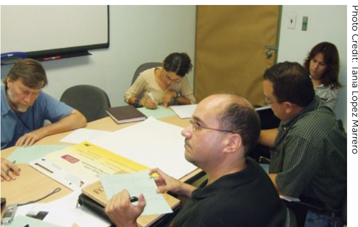
FIGURE 1. As part of the participatory listing process, participants generated individual lists of El Yunque's ecosystem services.

This same process was used to develop the list of drivers of change (Box 1), both those that influence El Yunque's ecosystem services positively and those that do not.