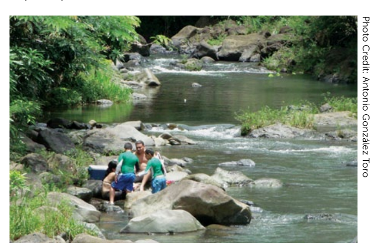
FIGURE 4. Participants from all stakeholder groups perceived recreation as a factor postively affecting El Yunque and its services.

Some positive drivers were mentioned just by scientists and forest managers. These included interagency collaboration and land acquisition for conservation (identified by scientists and forest managers), and reforestation around El Yunque (identified by scientists) (Table 3).