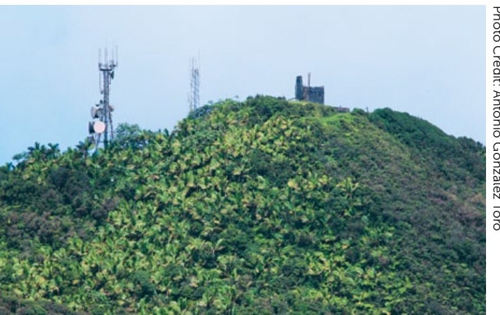
FIGURE 3. Telecommunication towers are one of the factors that community leaders perceived to be negatively affecting the forest's ecosystem services.